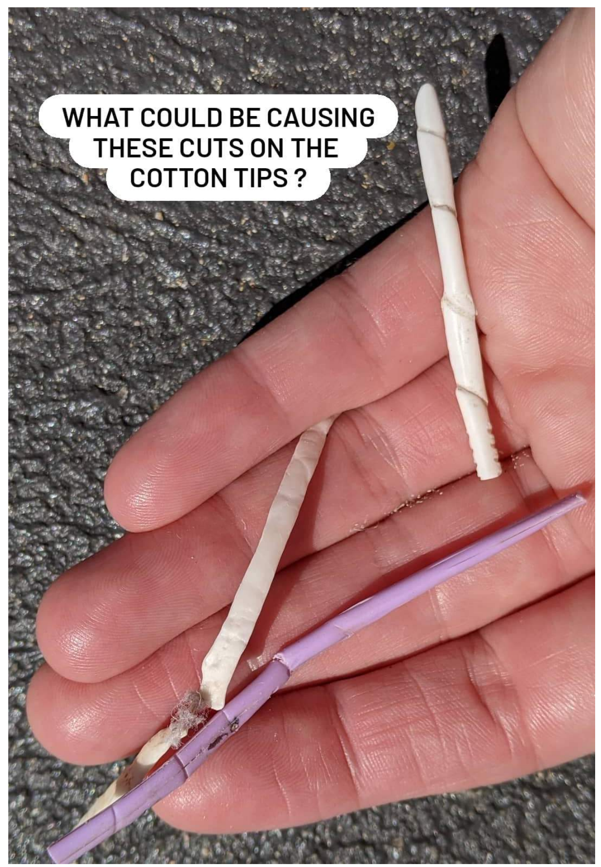
Are the 6mm filters causing this to stems when transverse