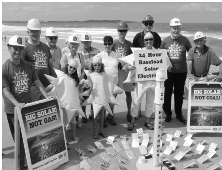
Sutherland CAN members show off 24 hour baseload solar thermal power at the launch of the Let's Build Big Solar campaign on Cronulla Beach in March.

In the Shire, the Sutherland Climate Action Network has continued working with the 100% Renewables campaign to amplify the community's near-unanimous support for the shift to renewable energy.