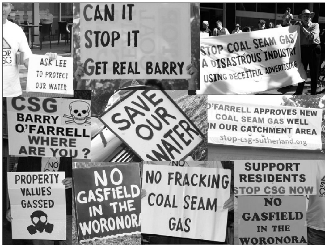
A collation of photos of the marvelous Stop CSG signs created by Col Ryan