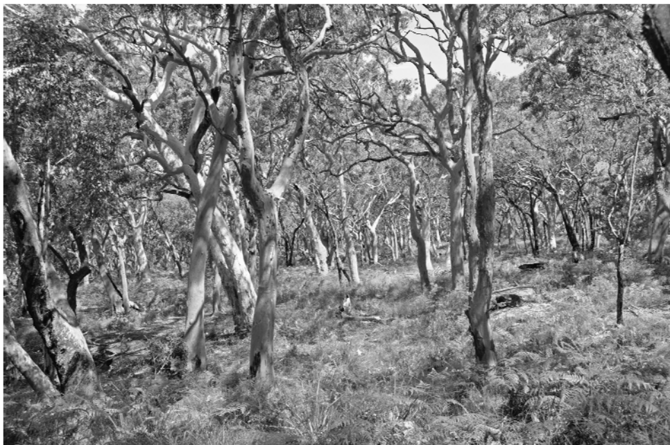
Bundeena woodland at the time of changing bark. Many of the gum trees shed their bark annually. The new bark can be very colourful.